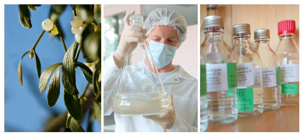
Viscum album – Mistletoe

All dosage forms of anthroposophic preparations must comply with the monograph of the relevant dosage form of the European Pharmacopoeia, unless otherwise justified.